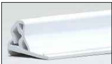
MASQUERADE/DESCOR AM TRACK

DRAWING BASED ON 1/2" POLYESTER FILL. PLEASE NOTE, FOR ANY OTHER ACOUSTICAL FILL, FURRING WILL BE NEEDED TO ACCOMMODATE THE THICKNESS OF THE FILL AND TO PREVENT THE ACOUSTICAL FILL FROM TOUCHING THE FABRIC.