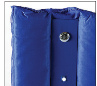
Lapendary Panel, 4000S Sailcloth Wrapped, Aluminum Stiffener/Gripper Bar