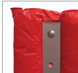
Lapendary panel, 4000P PVC wrapped, aluminum stiffener/gripper bar