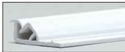
MASQUERADE/DESCOR AP TRACK

DRAWING BASED ON 1/2" POLYESTER FILL. PLEASE NOTE, FOR ANY OTHER ACOUSTICAL FILL, FURRING WILL BE NEEDED TO ACCOMMODATE THE THICKNESS OF THE FILL AND TO PREVENT THE ACOUSTICAL FILL FROM TOUCHING THE FABRIC.